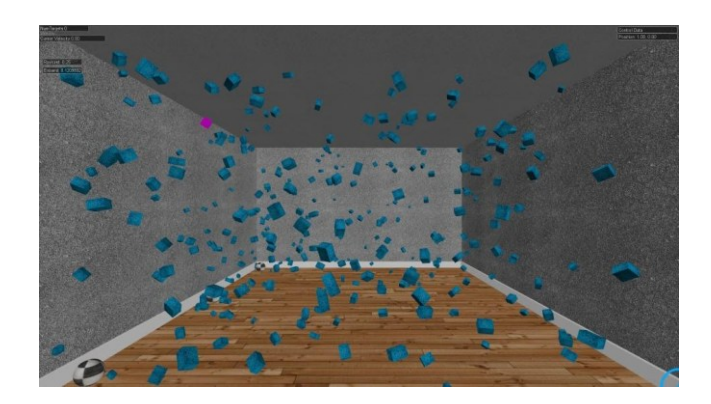
Figure 1: Selection Arena

IEEE Virtual Reality 2013 16 - 20 March, Orlando, FL, USA 978-1-4673-4796-9/13/$31.00 ©2013 IEEE