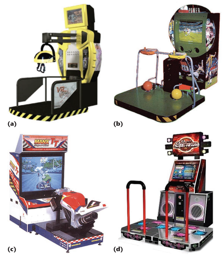
Figure 2. Arcade games that used more realistic input strategies: (a) BeachHead, (b) Football Power, (c) Manx TT, and (d) Dance Dance Revolution. Such innovative interfaces helped arcade games compete with PCs and game consoles.

It became clear that arcade games couldn't compete with game consoles and PCs, in terms of graphics, sound, and length of play per gaming session. So, to compete with game consoles, the only thing video arcades could do was innovate at the user interface. This innovation came in the form of a variety of input devices and strategies that got players more actively involved.