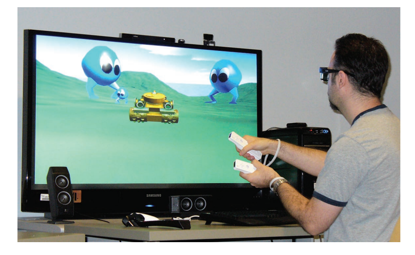
Figure 4. One of the Interactive System and User Experience Lab's 3D UI gaming stations. The user is head tracked and sees the screen in 3D stereo while controlling a virtual tank with two Wiimotes.

users fight enemies using a sword and shield, a bow and arrow, and a set of spells they can sketch with the sword. Our research aimed to leverage existing 3D UI techniques in the context of a video game. The game was played in a four-sided CAVE (Cave Automatic Virtual Environment) with 6-DOF trackers. Unfortunately, most people probably don't own a four-sided CAVE or an expensive 6-DOF tracking system. The project was successful in that it showed what might be possible in the future. However, it didn't address how to deal with the limitations of today's game input device hardware. It also didn't look at how to improve existing VR and 3D UI hardware to make it as affordable as a Wiimote or a standard TV.