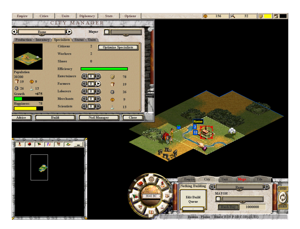
Figure 1: Call to Power 2 (CTP2) is a turn-based strategy game similar to Civilization.

and cities. However, the complete game provides two other means of victory, one through diplomacy through the forming of alliances, and the other through scientific advancement via building a special wonder.